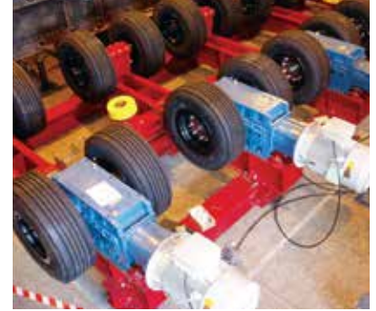
Sepro Pneumatic Tyre Drive System (PTD)