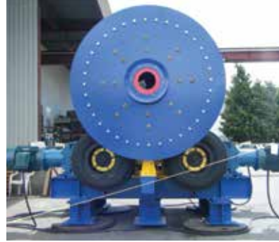
1.8 x 3.6 Sepro Ball Mill