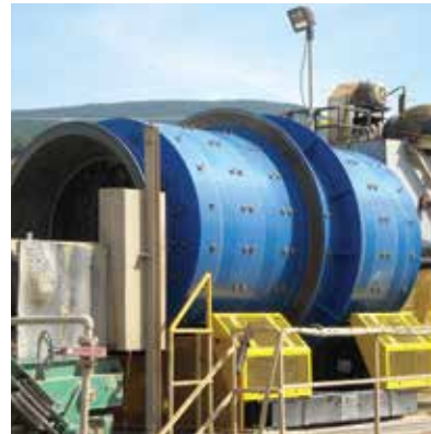
2.4 x 4.2 Sepro Scrubber