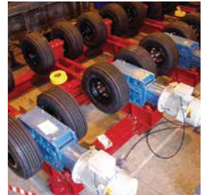
Sepro Pneumatic Tyre Drive System (PTD)

*Engineered replacement for North American built 8 ft. x 14 ft. Scrubber.