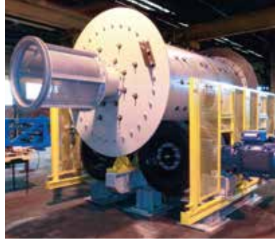
1.5 x 3.6 Sepro Ball Mill